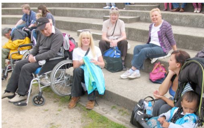
Waiting at Whipsnade Zoo.....