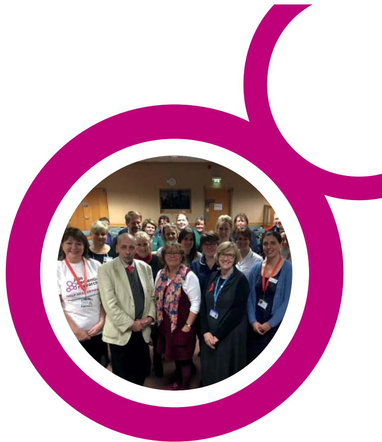
The team who enabled Lincolnshire to be the first Join Dementia Research champion county

Ensuring that Join Dementia Research becomes a part of the culture of each organisation can be challenging. United Lincolnshire Hospitals NHS Trust has made a significant step of adopting change by adding the 'Provide a Join Dementia Research leaflet' to their Trust's Dementia Care Bundle - a set of interventions used for patients with dementia; with the intention to significantly improve patient outcomes.